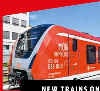
NEW TRAINS ON THE HAMBURG S-BAHN (METRO)

The new Hamburg S-Bahn (metro) 490 series vehicles were introduced into the fleet in December 2018 with outstanding features such as seamless carriages, air-conditioning, new passenger information systems and multipurpose compartments. We are investing in new facility capacities and the modernization of existing fleets on the Hamburg S-Bahn (metro).