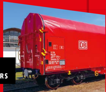
NEW PROCUREMENT OF COIL TRANSPORT CARS

The coil transport car of the type Sahimms 900.2 will be completely rebuilt and fitted, among other things, with a state-of-the-art tarpaulin covering. Modernization of all 430 cars is expected to be completed by 2020.