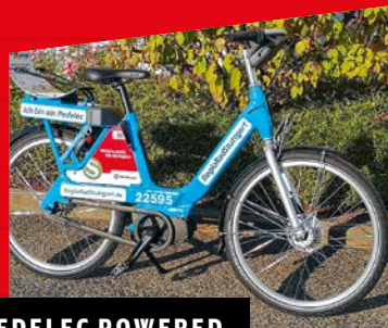
NEW PEDELEC POWERED BY CALL A BIKE

We expanded our existing bike-sharing service by a further 500 bicycles in 2018. Pedelects use electric motors to support pedaling for up to 70–80 km on one battery charge and are easy to use: the motor switches on when the bicycle is unlocked and switches off again when locked. The electric motor mainly gives support when riding up-hill and adapts to the pedal strokes.