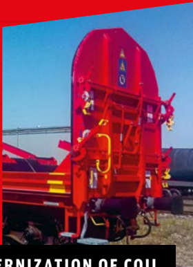
MODERNIZATION OF COIL TRANSPORT CARS

The coil transport car of the type Sahimms 900.2 will be completely rebuilt and fitted, among other things, with a state-of-the-art tarpaulin covering. Modernization of all 430 cars is expected to be completed by 2020.