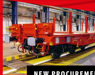
NEW PROCUREMENT OF BOGIE FLAT CARS

DB Cargo is procuring new six-axle flat wagons of the type Samms 489.1 with high load capacity for transporting heavy semi-finished steel products, among other items. The cars are an important part of the value-added chain in steel manufacturing and are essential to securing transport between plants. Delivery of the new fleet comprises 225 cars in total, of which 18 are flat cars that were delivered in 2018.